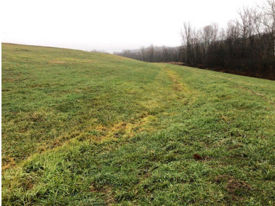
Photograph 25: East non-contact stormwater channel looking north is clear of obstructions. East final cover lower slope is well vegetated and mowed annually. No evidence of animal burrows, erosion, or stability issues.