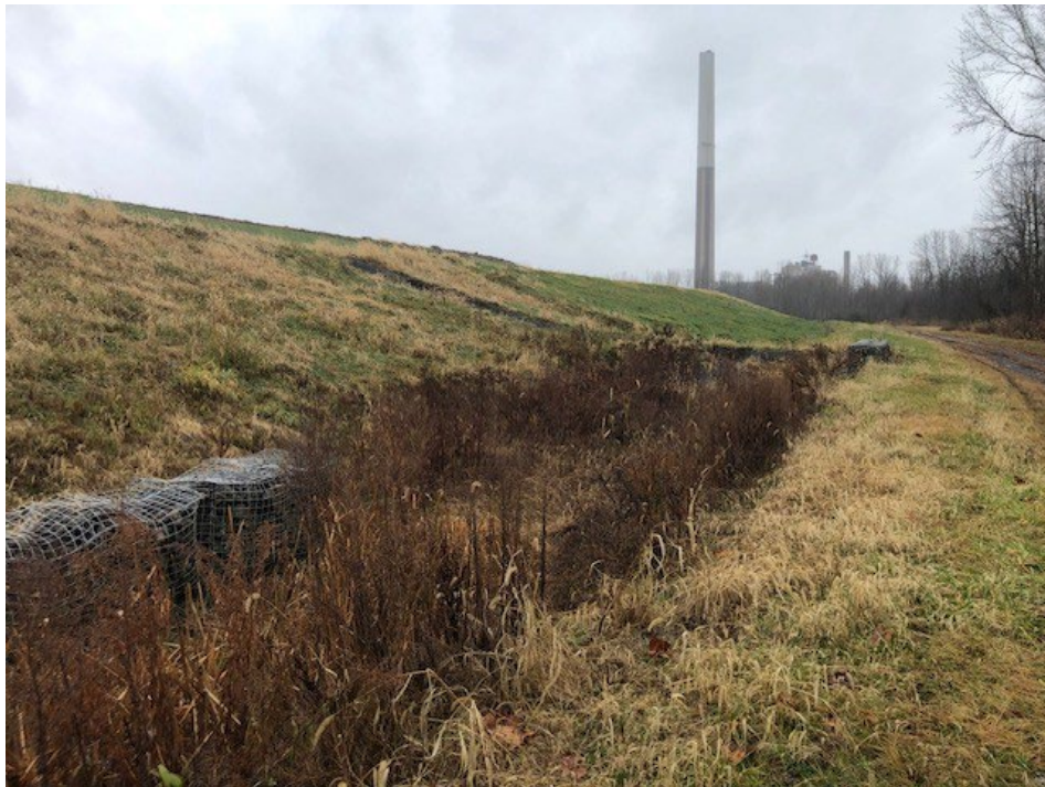
Photograph 15: West non-contact stormwater channel looking south is clear of obstructions. West final cover lower slope is well vegetated and mowed annually. No evidence of animal burrows, erosion, or stability issues.