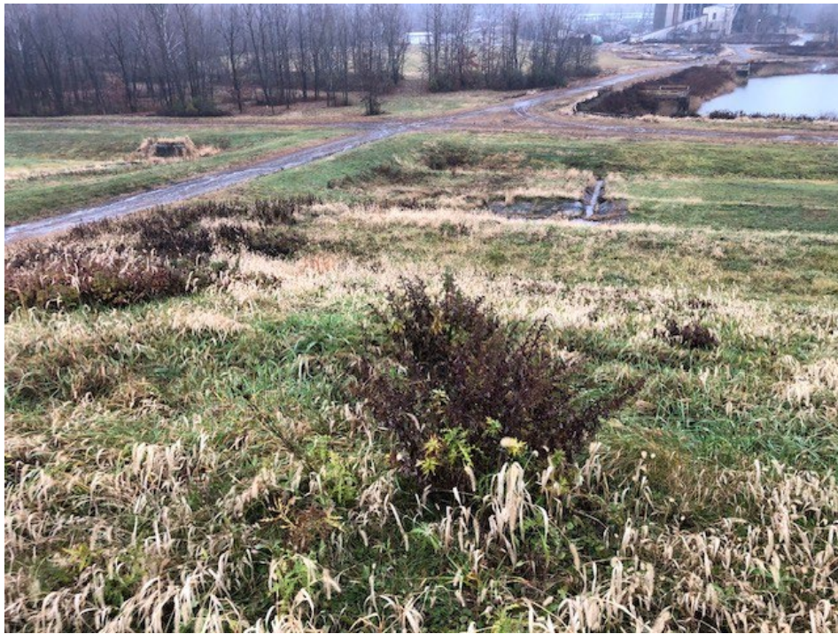
Photograph 9: Stage 4 south slope is well vegetated and mowed annually. No evidence of animal burrows, erosion, or stability issues.