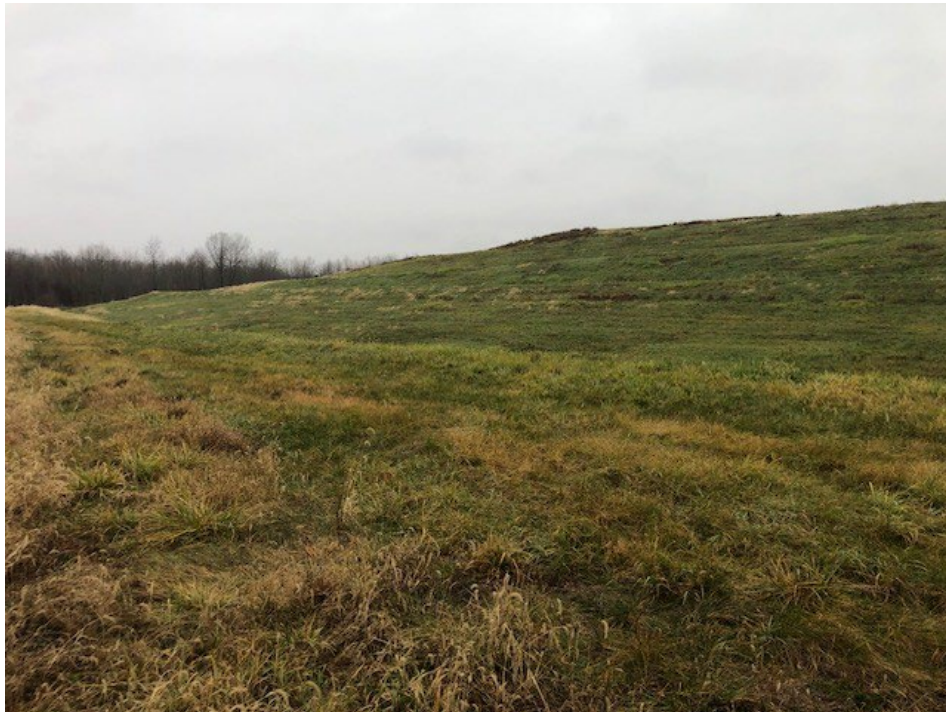
Photograph 12: Non-contact stormwater channel on south slope is clear of obstructions. The final cover south slope is well vegetated and mowed annually. No evidence of animal burrows, erosion, or stability issues.