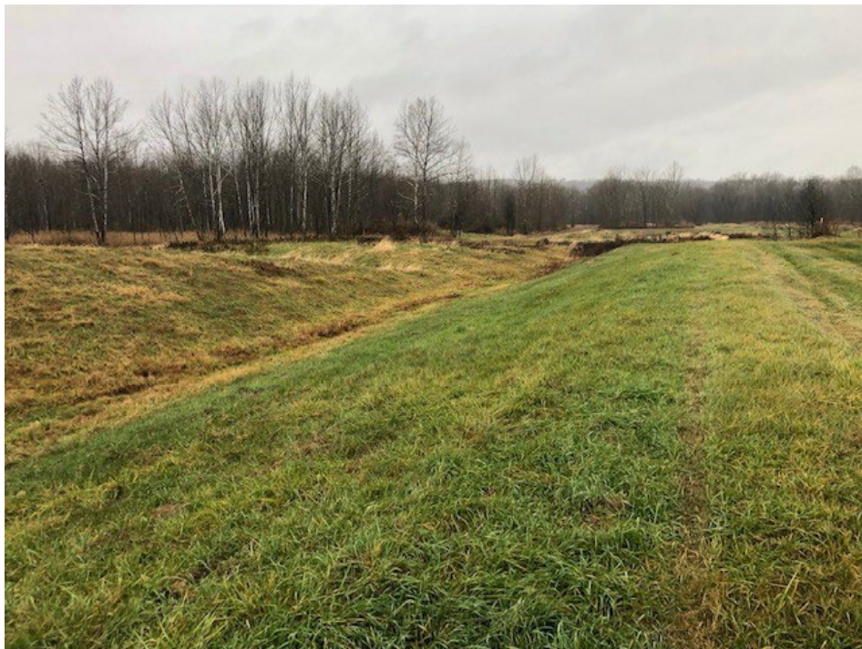
Photograph 20: North non-contact stormwater channel is clear of obstructions. North final cover lower slope is well vegetated and mowed annually. No evidence of animal burrows, erosion, or stability issues.