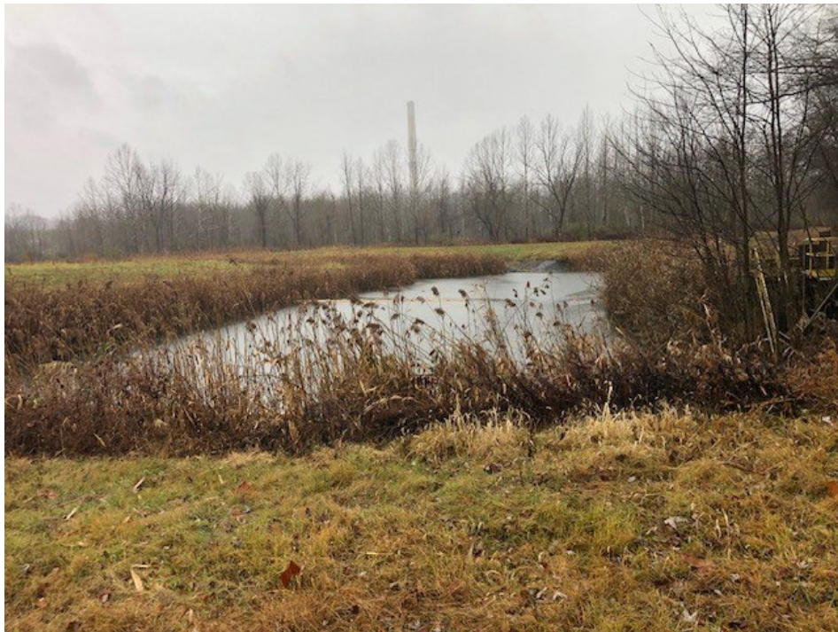
Photograph 19: Non-contact stormwater Sedimentation Pond.