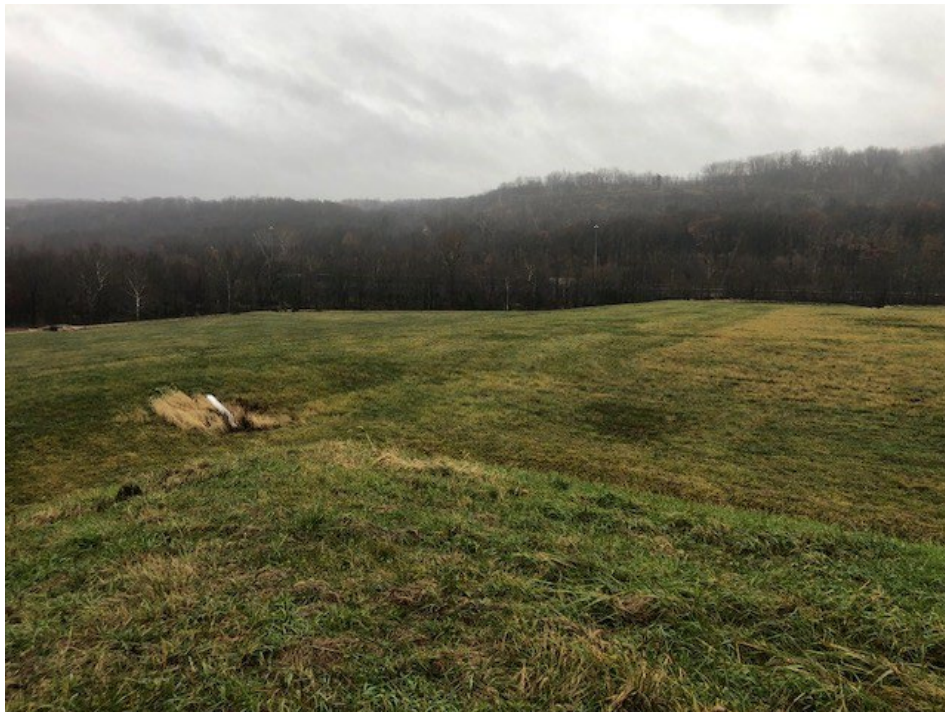
Photograph 2: Stage 5/Stage 6 final cover is well vegetated and mowed annually. No evidence of animal burrows, erosion, or stability issues.