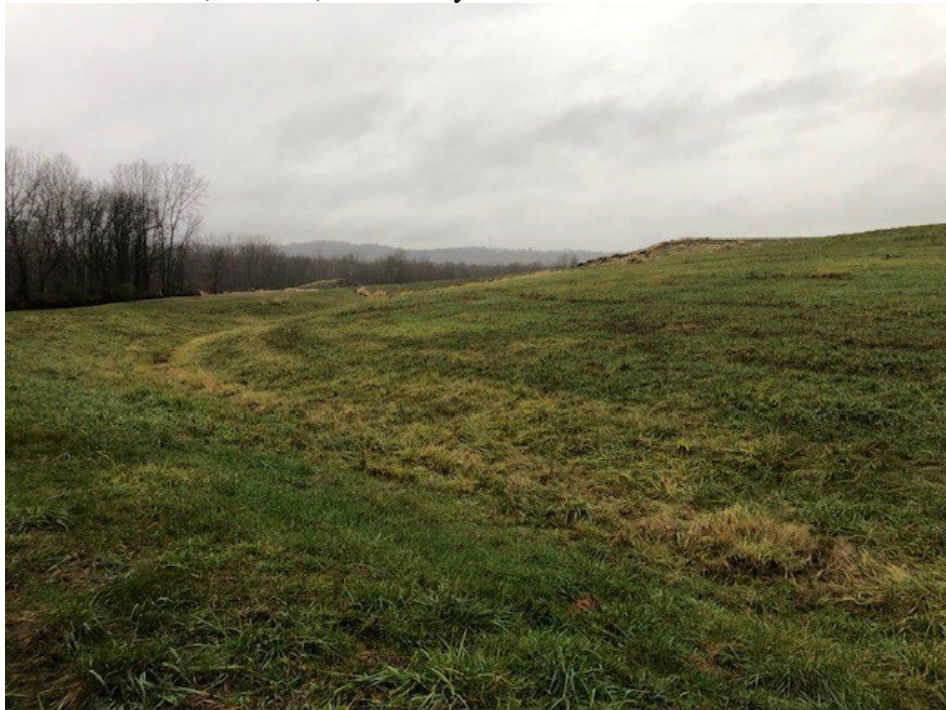
Photograph 26: South non-contact stormwater channel looking west is clear of obstructions. South final cover lower slope is well vegetated and mowed annually. No evidence of animal burrows, erosion, or stability issues.