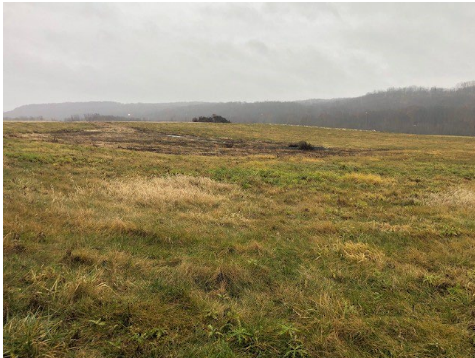
Photograph 8: Intermediate cover in Stage 4 active area looking northwest is well vegetated and mowed annually.