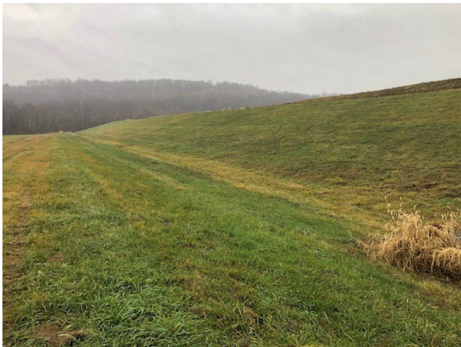
Photograph 22: North non-contact stormwater channel is clear of obstructions. North final cover lower slope is well vegetated and mowed annually. No evidence of animal burrows, erosion, or stability issues.