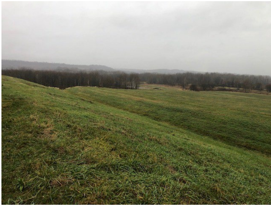
Photograph 3: Stage 5 final cover is well vegetated and mowed annually. No evidence of animal burrows, erosion, or stability issues.