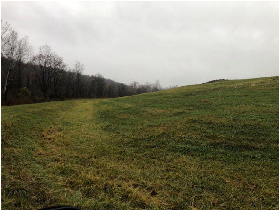
Photograph 24: East non-contact stormwater channel looking south is clear of obstructions. East final cover lower slope is well vegetated and mowed annually. No evidence of animal burrows, erosion, or stability issues.