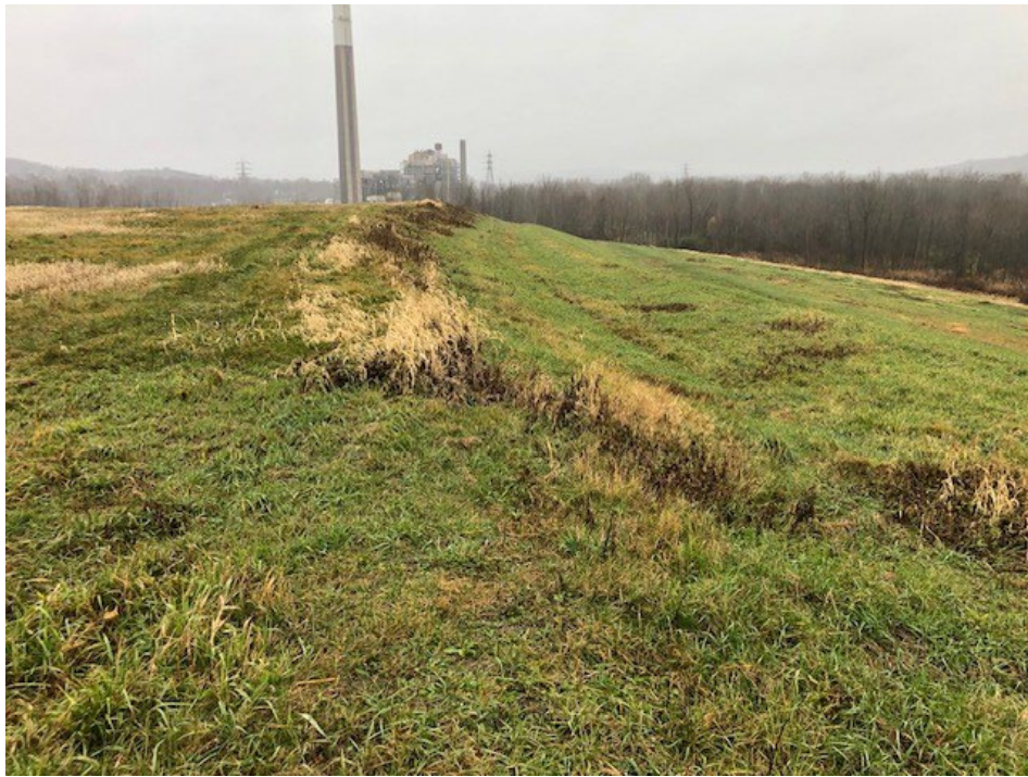
Photograph 5: Stage 4 west slope is well vegetated and mowed annually. No evidence of animal burrows, erosion, or stability issues.