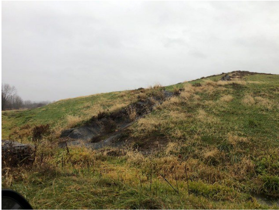
Photograph 13: Non-contact stormwater downchute in southwest corner is clear of obstructions. Gabion energy dissipator is installed at junction with the stormwater perimeter ditch.