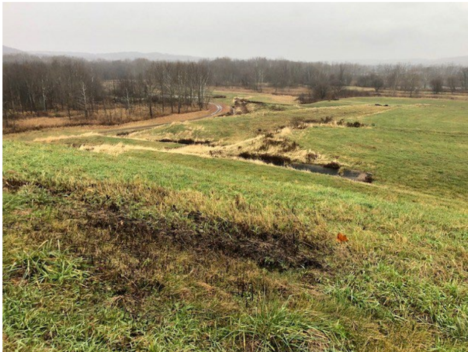
Photograph 4: Downchutes from west side of Stage 4 and Stage 5. No evidence of animal burrows, erosion, or stability issues.