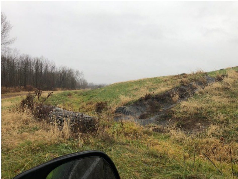
Photograph 14: West non-contact stormwater channel looking north is clear of obstructions. West final cover lower slope is well vegetated and mowed annually. No evidence of animal burrows, erosion, or stability issues.