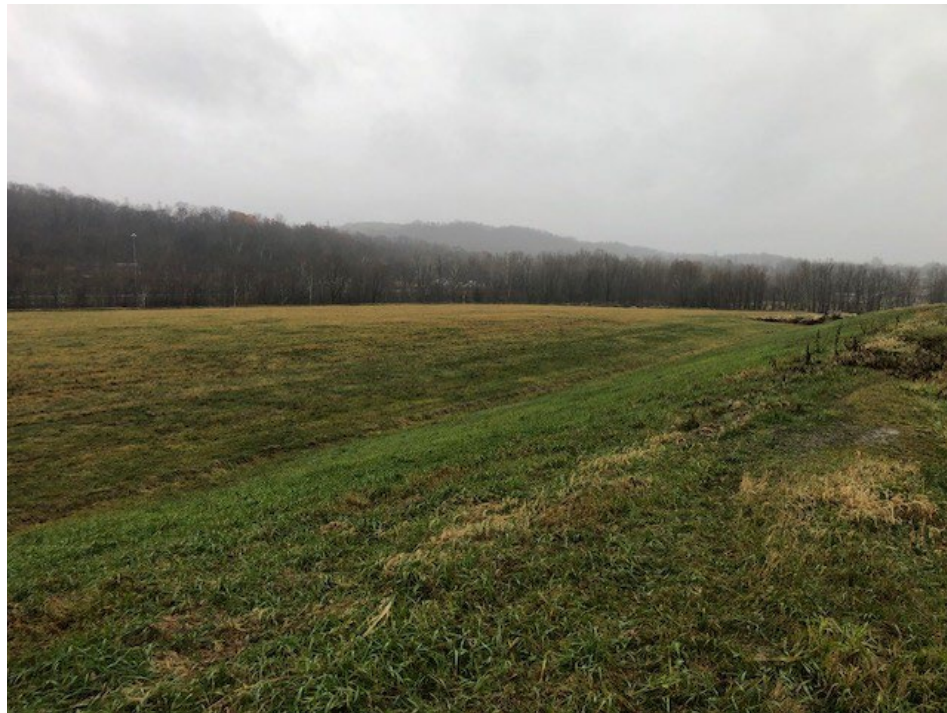
Photograph 1: Stage 6 final cover is well vegetated and mowed annually. No evidence of animal burrows, erosion, or stability issues.