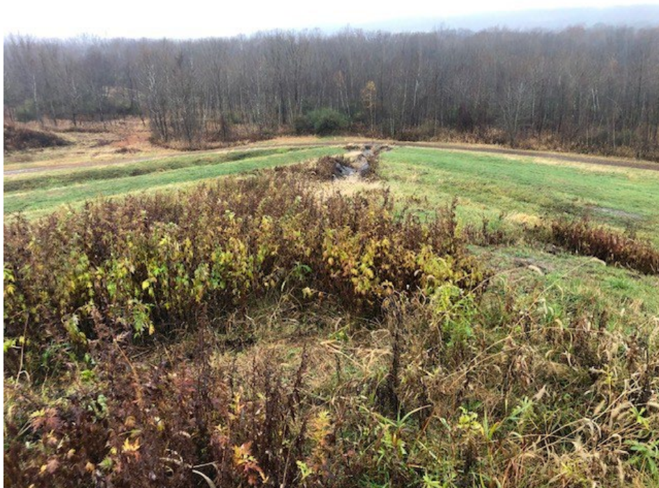
Photograph 6: Stage 4 southwest corner slope and downchute is well vegetated and mowed annually. No evidence of animal burrows, erosion, or stability issues.