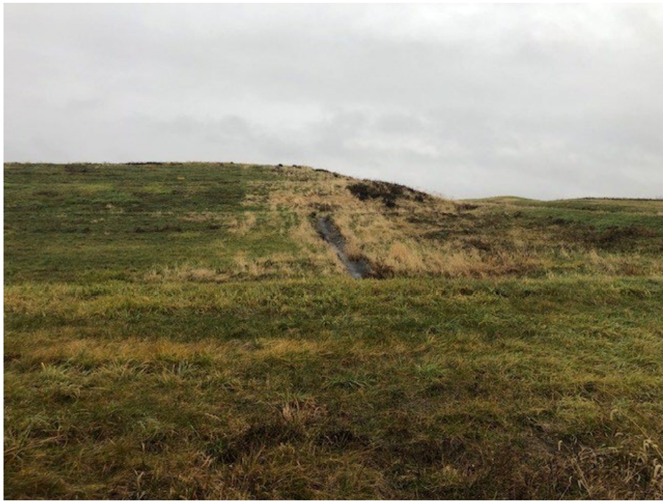
Photograph 11: Non-contact stormwater downchute on south slope is clear of obstructions. Gabion energy dissipator is installed at the junction with the stormwater (non-contact water) perimeter ditch.