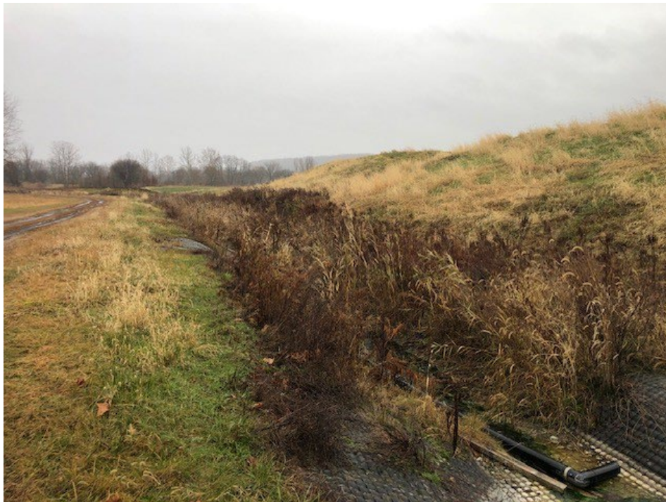
Photograph 17: West non-contact stormwater channel looking north is clear of obstructions. West final cover lower slope is well vegetated and mowed annually. No evidence of animal burrows, erosion, or stability issues.