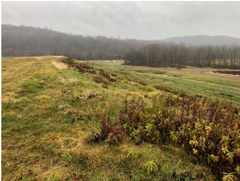
Photograph 7: Stage 4 south slope is well vegetated and mowed annually. No evidence of animal burrows, erosion, or stability issues.