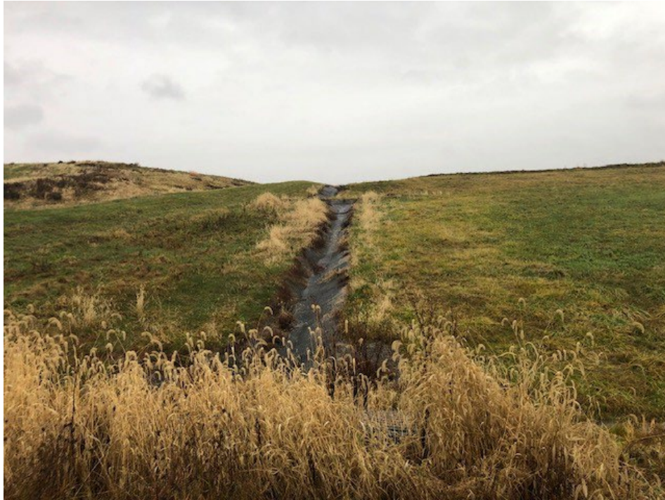
Photograph 27: Non-contact stormwater downchute on south slope is clear of obstructions. Gabion energy dissipator is installed at the junction with the stormwater (non-contact water) perimeter ditch.