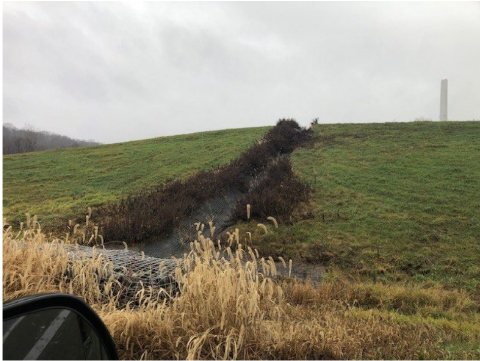
Photograph 23: Non-contact stormwater downchute in northeast corner is clear of obstructions. Gabion energy dissipator is installed at the junction with the stormwater (non-contact water) perimeter ditch.