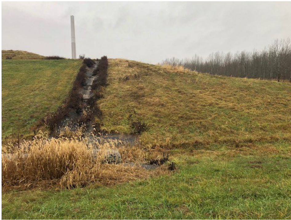
Photograph 21: Non-contact stormwater downchute in northwest corner is clear of obstructions. Gabion energy dissipator is installed at the junction with the stormwater (non-contact water) perimeter ditch.