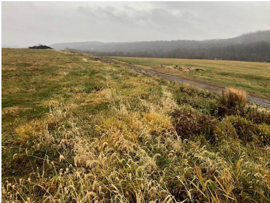
Photograph 10: Intermediate cover area in Stage 4 active area /Stage 6 final cover is well vegetated and mowed annually.