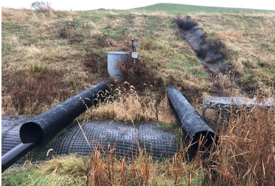
Photograph 16: Leachate collection zone and leak detection zone discharge pipes.