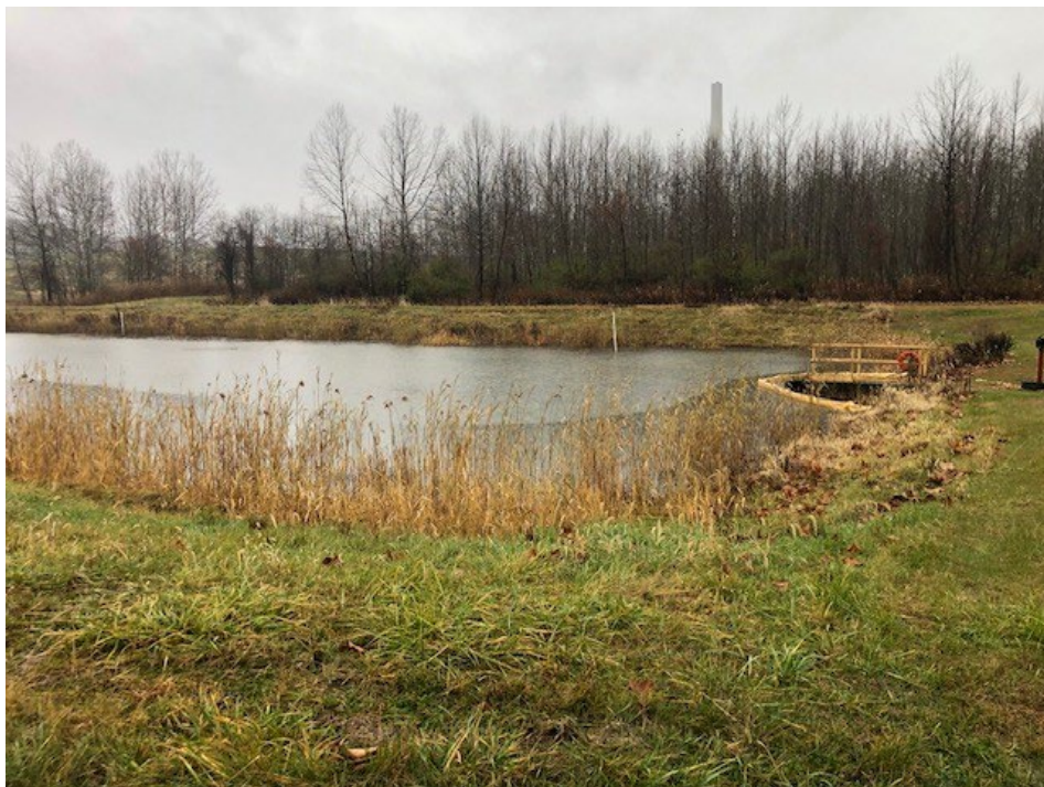
Photograph 18: Leachate (contact water) Pond. No evidence of animal burrows or liner damage.